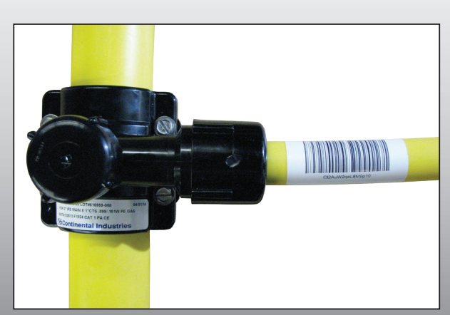
After installation, Bar Code Label may be placed on the Fitting, the Pipe or kept with your Paper Work