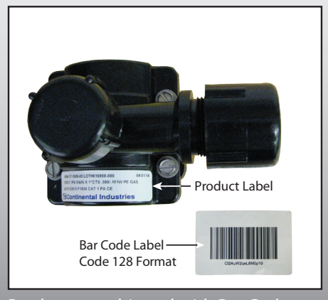
Products are shipped with Bar Code Label placed loose in Shipping Bag